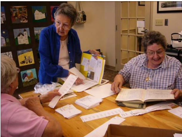
Volunteers researching and planning the memorial garden.